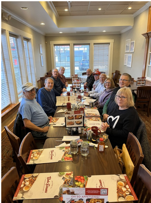
DCMC Club Breakfast January 23, 2025

Cold weather is upon us! Hopefully your ponies are wrapped up in warm space. Flu season is also here. Please take care of yourselves. Stay warm and stay safe during this winter season.