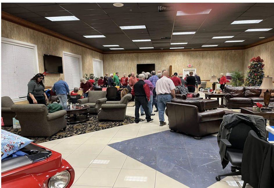
DCMC Christmas Party December 10, 2024

By the time you receive this, Thanksgiving has come and gone. May we all be thankful for the blessings bestowed upon us and our families. Merry Christmas and Happy New Years to everyone!