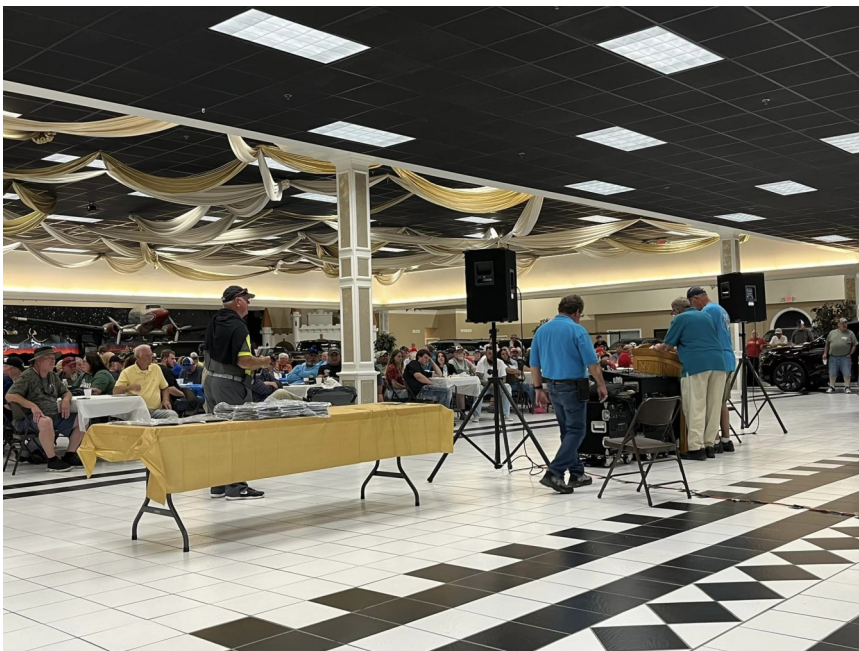
Fordfest Awards October 12, 2024