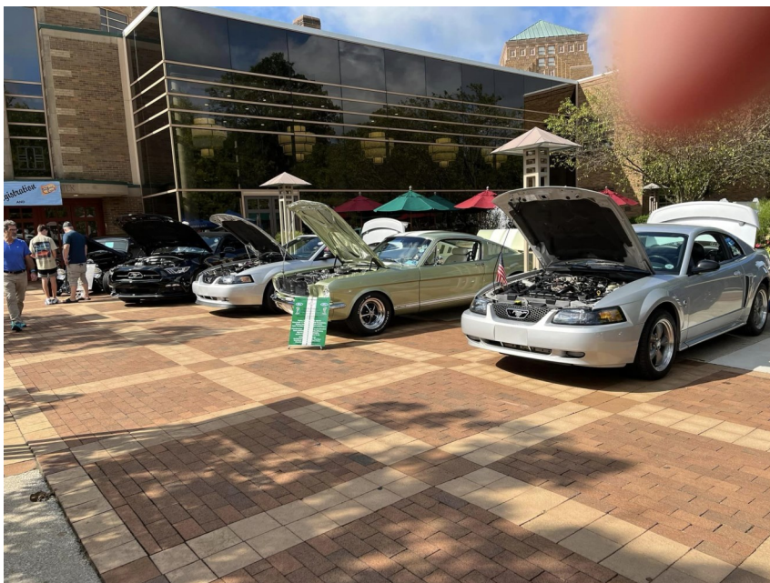
Kunkel Car Show August 2024

The club continues to stay busy traveling the country participating in local and MCA shows. Come on out and show us your 'Stangs! Speaking of fun, the 35th annual Fordfest is coming soon!!