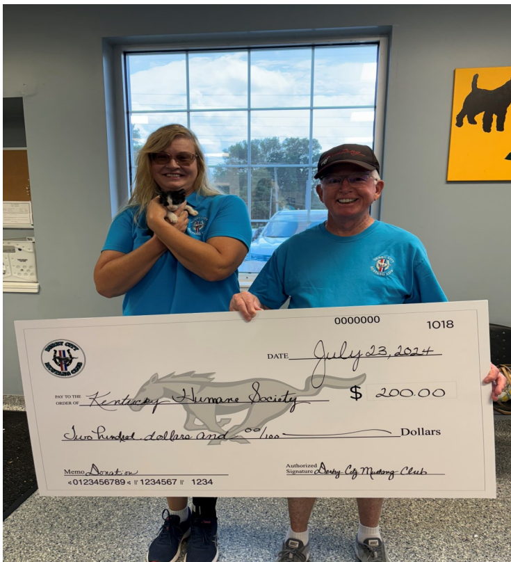
Humane Society Donation

Man have there been a lot of events going on! Come on out and join us at one of the many cruise-ins and car shows going on.