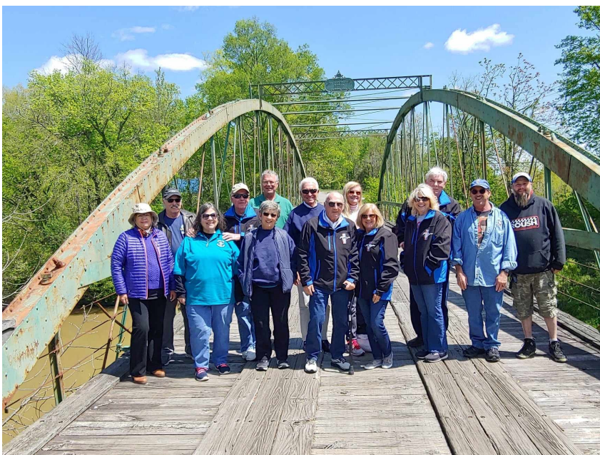
Rough River Cruise and Lunch Apr 21, 2024

Activities are in full swing. Lot's of parades, car shows, cruise-ins; you name it and it's going on here in Louisville. Come on out and enjoy the fun fellowship, and in many occasions— food! We look forward to seeing you at our events!